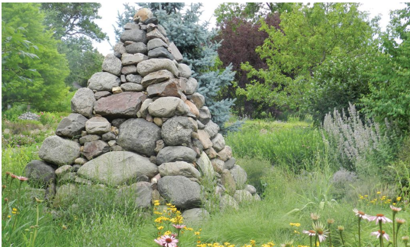
ABOVE: In the secret garden at Northwind Perennial Farm, Steve Coster, the Hardscape and Woody Tree Expert has created a stacked stone pyramid. Complementing the almost sculpture-like piece are the following grasses: Sesleria Autumnalis , more commonly known as autumn moor grass and Sporobolus Heterolepsis known as prairie dropseed. Accent plants include Echinacea Tennesseeensis or purple cone flower and Coriopsis Palmata known as tickseed.

Founded in 1991, Northwind Perennial Farm is co-owned by three friends and business partners. Colleen Garrigan, Steve Coster and Roy Diblik share a sense of responsibility to carefully curate the land. After purchasing the old farmstead property, they agreed to focus on sustainability and aesthetic integrity. They also resolved to maintain the property's unique connection to the past. Using the natural landscape, they created home-spun display areas: a meadow garden, arbor, pond, chicken coop, picket fence garden, woodland garden and fountains.